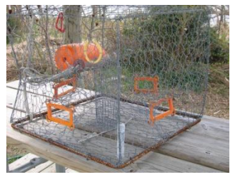
Crab pot with BRD's attached; photo by Diane Tulipani

get a copy of detailed instructions for making your own BRDs.